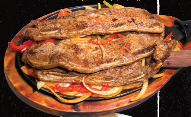
Costilla de Res a la Plancha