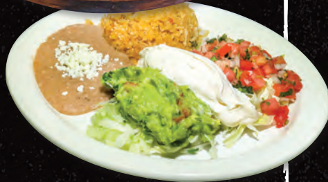
Arrachera El Tenampa

* CONSUMING RAW OR UNDERCOOKED MEATS, POULTRY, SEAFOOD, SHELFISH, EGGS OR UNPASTEURIZED MILK MAY INCREASE YOUR RISK OF FOOD-BORNE ILLNESS